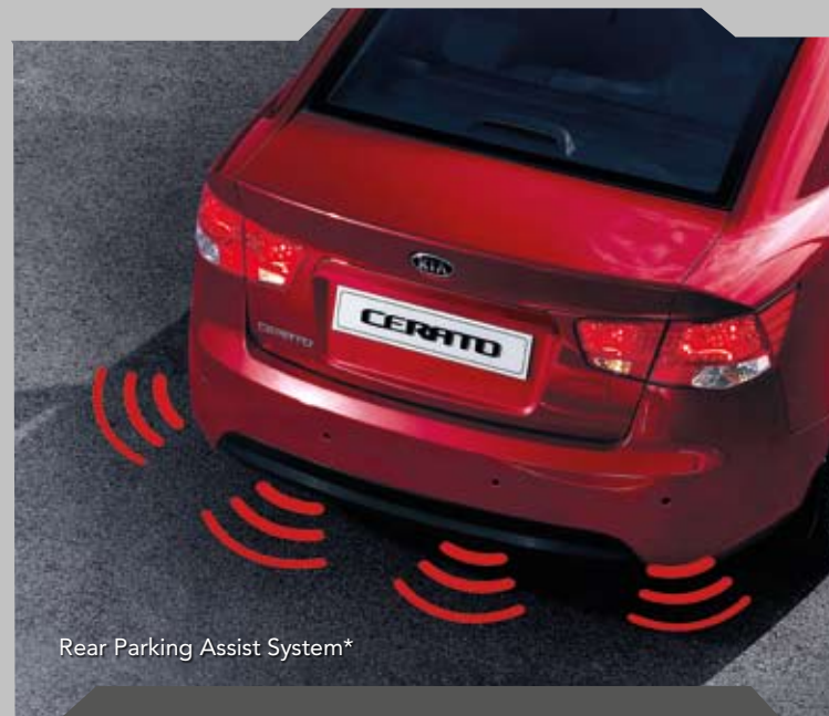
Rear Parking Assist System*