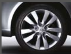
17-inch (215/45R-17") alloy wheel (2.0 SX Model)