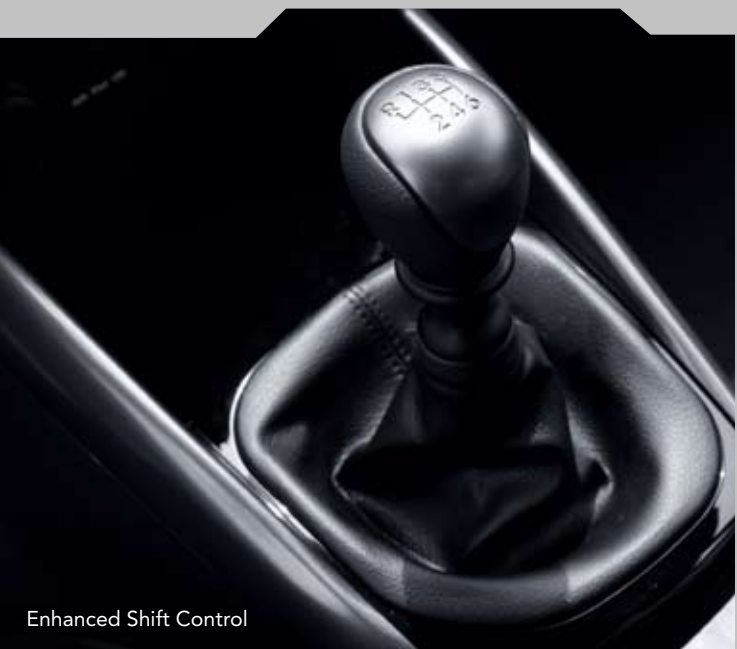
Enhanced Shift Control

The Continuously Variable Valve Timing (CVT) system provides reduced fuel consumption and CO 2 emissions as well as more power. The integrated catalytic converter reduces the weight of the exhaust system and delivers endurance with its stainless steel exhaust manifold. The electric motor-driven power steering system creates enhanced steering stability and reduced fuel consumption by 3% over the existing hydraulic system.