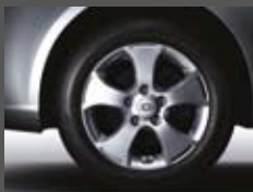
16-inch (205/55R-16") alloy wheel (1.6 EX Model)

5-YEAR/100 000km WARRANTY • 4-YEAR/90 000km SERVICE PLAN