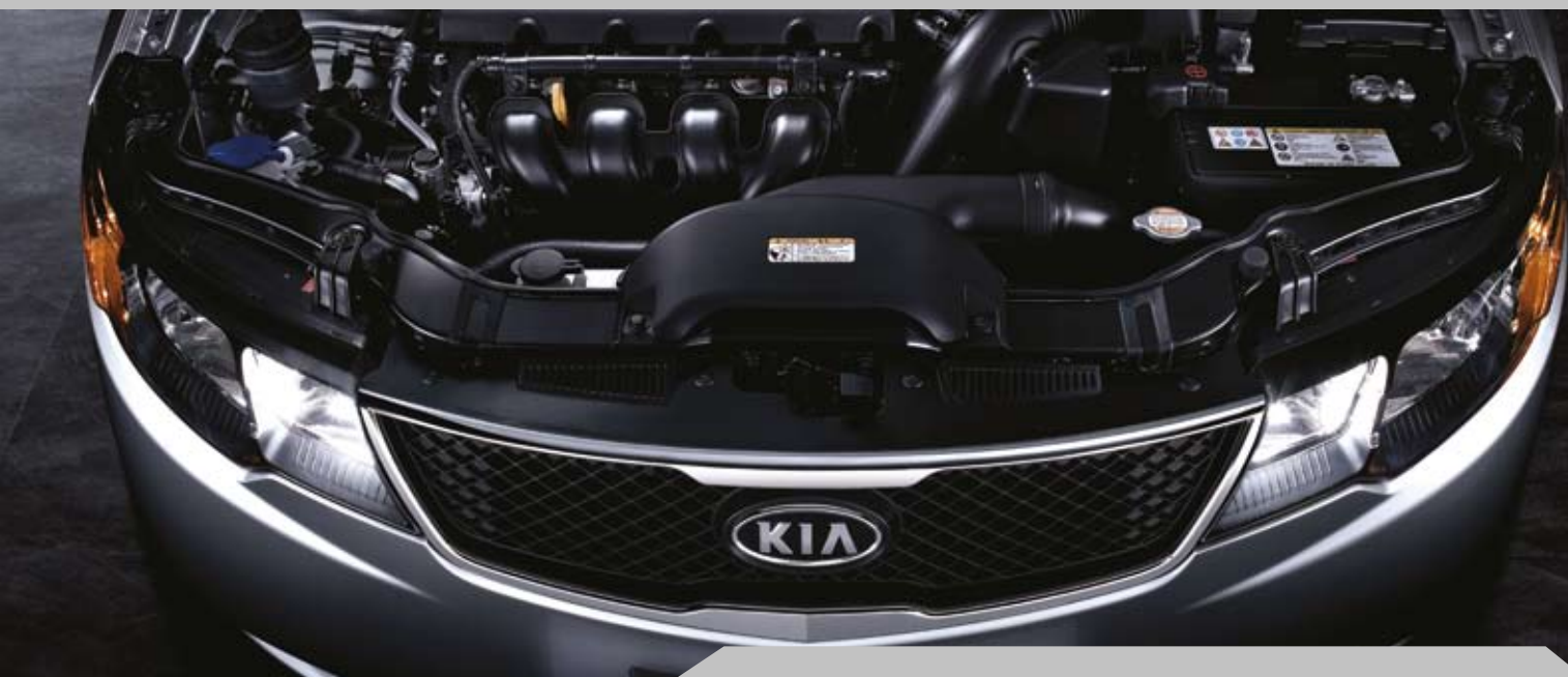
In-line 4 DOHC CVT Engine